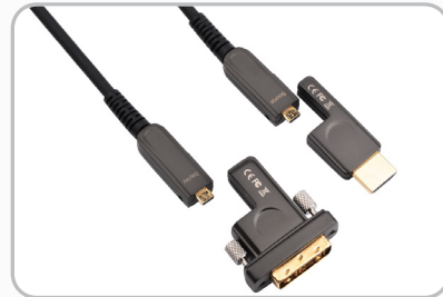
micro HDMI (D)